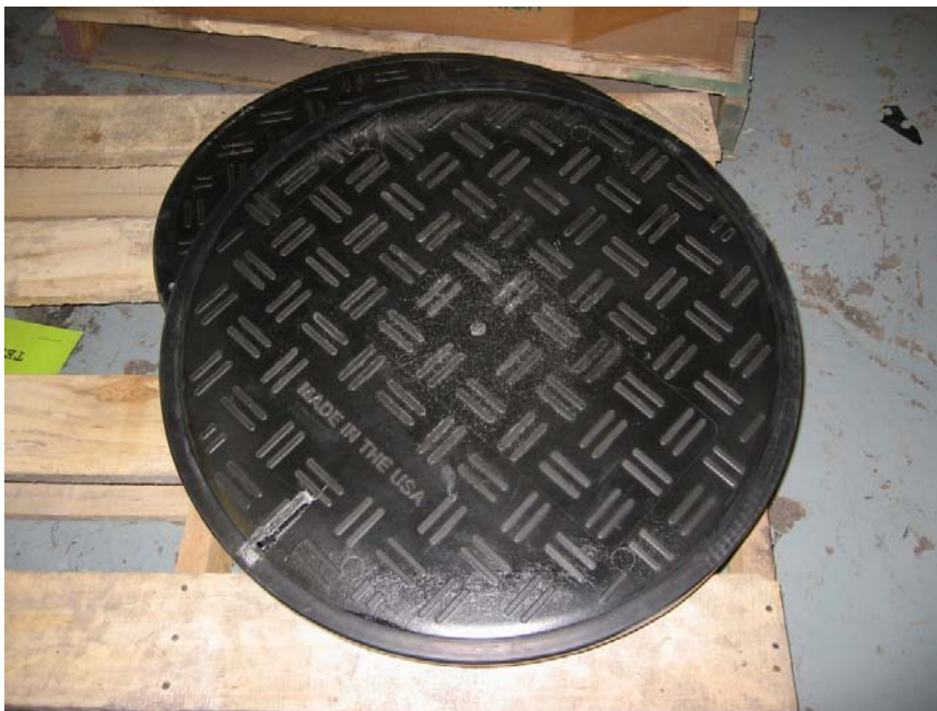
Figure 2 - GMI 2400 AASHTO-2 samples.