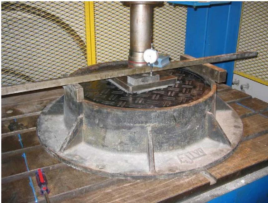
Figure 3 - GMI 2400 AASHTO test set-up.