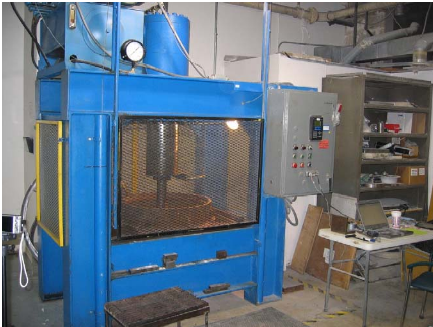
Figure 1 - Test set-up.