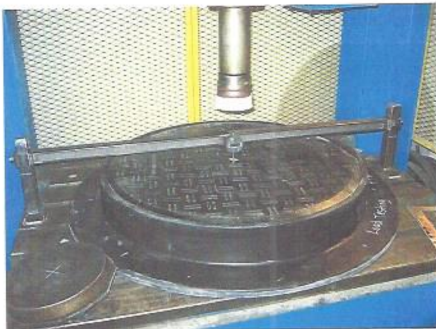
Figure 2 - EN 32 inch zero displacement set.