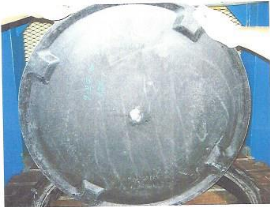
Figure 1 - EN 32 inch #2.